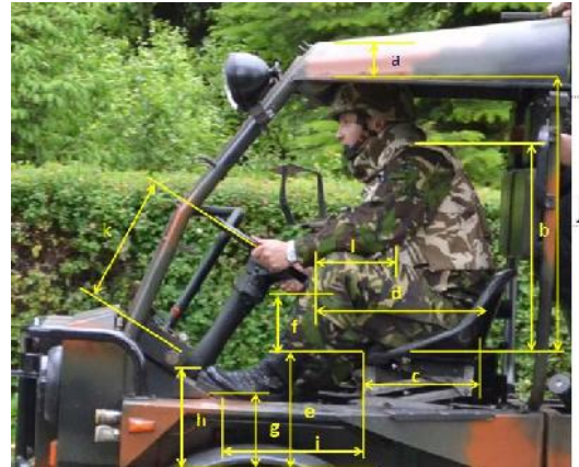
FIG. 2. Live images during a demonstrative exercise (the driver is 1,74 m tall)

Another standards which require comfort-specific requests are: