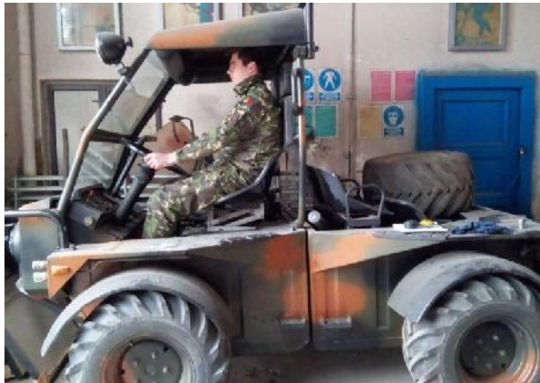
FIG. 3. The 1-st position for a driver of 1,84 m

vehicles. So, it could be said that the driver's seat ergonomics is realized completely differently and the driver's sensations differ as well.