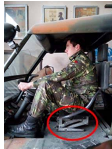
FIG. 4. The 2-nd position for a driver of 1,84 m

In the case of the light off-road articulated vehicle, DAC 2.65 FAEG, from the comfort point of view, one can notice the lack of suspension system, thus leading to transporting the crew over a long period of time without fatigue occurrence.