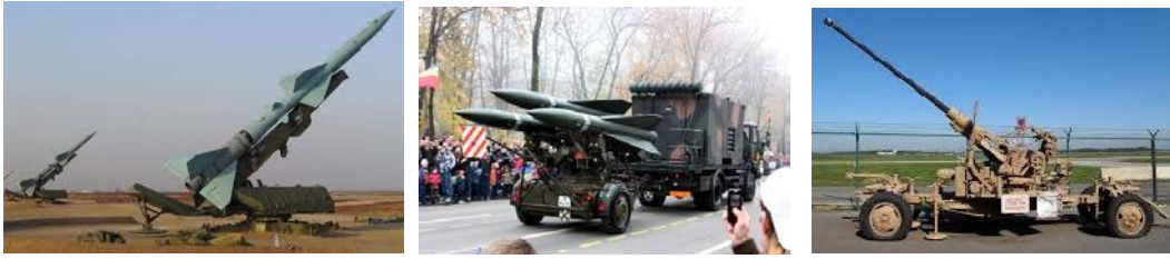
FIG. 5. AD EQUIPMENT OF THE AIR FORCE

The Air Force launched a RFI document (Request for Information) concerning an acquisition of a VSHORAD/SHORAD systems destined for the AFB's (Air Force Base) protection mainly, and the self-defense means of the Deveselu NATO strategic area assure coverage for a large part of Romanian infrastructure.