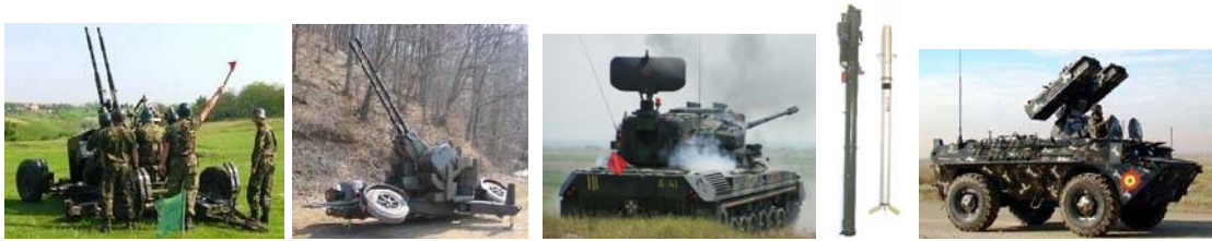
FIG. 2. CLOSE RANGE AD EQUIPMENT OF THE GROUND FORCES

x 35 tracked and 2 x 35 self-propelled), as well as with VSHORAD (Very Short Range Air Defense) local-built missile systems (CA-94 and CA-95).