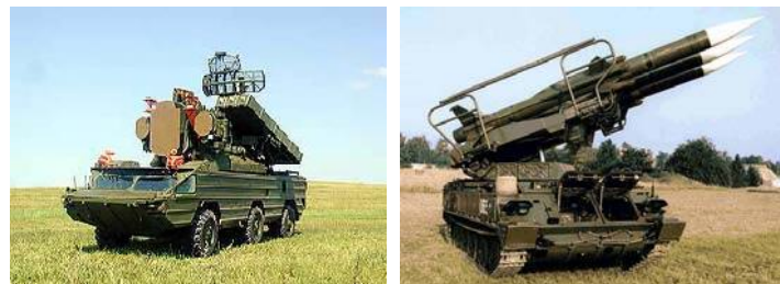
FIG. 4. SHORAD/MRAD EQUIPMENT OF THE GROUND FORCES

Regarding the equipment of the AD regiments, the Russian origin SA-8 and SA-6 ADMS have enough good engagement performances, but their technical resource is almost consumed. However, these are susceptible to perform a life cycle up-grading program [4], [5], going even to the missile replacement [8], [9], [10].