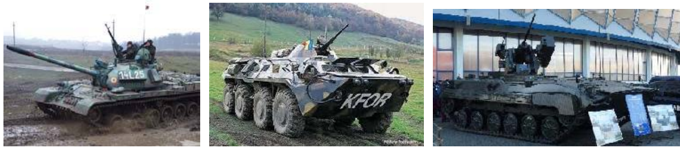
FIG. 3. THE 12.7 MM, 14.5 MM AND 25 MM WEAPONS ON MBTs, APCs AND IFVs

At the infantry and mechanized units, the close AD is supported by the heavy machine-guns of the armored vehicles.