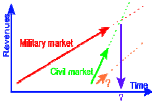
Fig. 1 – The estimated evolution of the European military and civil UAV markets [2]

In Fig. 1 may be seen a faster trend of growth for the civil sector, compared with the military one. As a result, it's just a matter of time before research and development of civil applications where UAVs are more numerous, will surpass those of the military